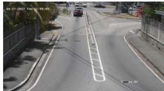
Entrance - Daytime

We are pleased to advise that we installed cameras at the roundabout, north of Buccaneer Drive and the empty lot at WASA to capture vehicles/pedestrians entering and leaving our neighbourhood. The cameras are equipped with night vision and have the capability to capture vehicle number plates.