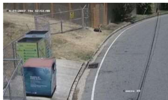
Recycling / Wasa Exit